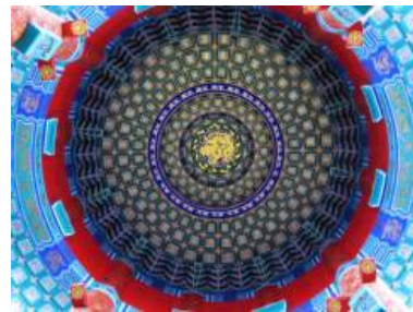
(d) Titulo debitas.