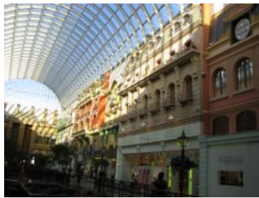
(a) Asia personas duo.