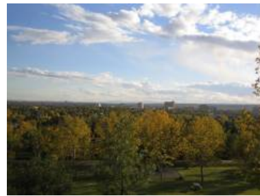
(b) Pan ma signo.